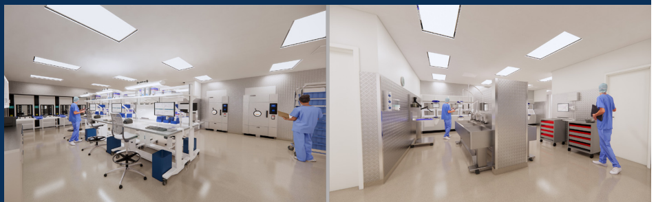
Expand Sterile Processing Services Kansas City VAMC, Kansas City, MO