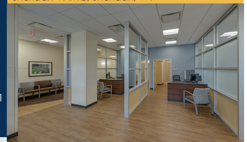
Emergency Department Renovation/Addition Memorial Hermann HCS, Houston, TX