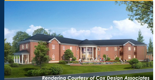
Rendering Courtesy of Cox Design Associates