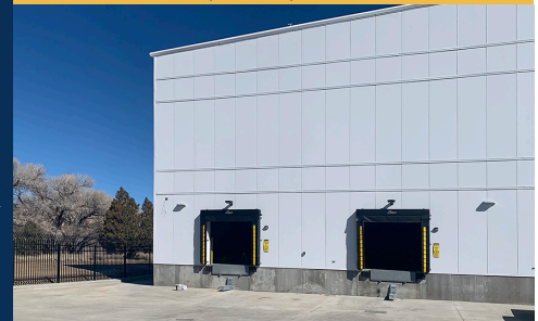
Replacement Warehouse Northern Arizona VAMC, Prescott, AZ