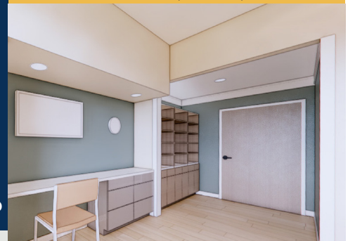
Expand Community Living Center B81 Roseburg VAHCS, Roseburg, OR