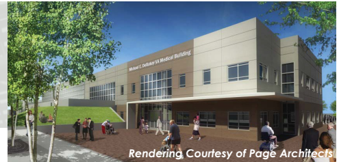
Rendering Courtesy of Page Architects