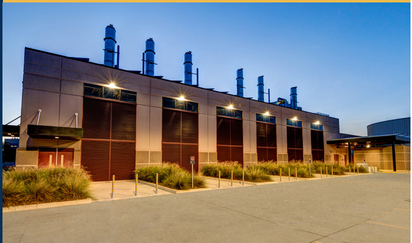
Combined Heat & Power Plant Michael E. DeBakey VA Medical Center, Houston, TX