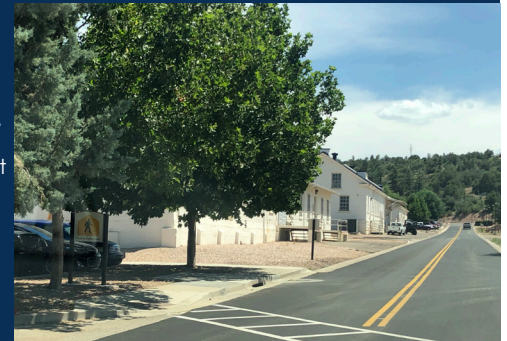
Repair/Resurface Roads, Phase 4 Northern Arizona VAMC, Prescott, AZ