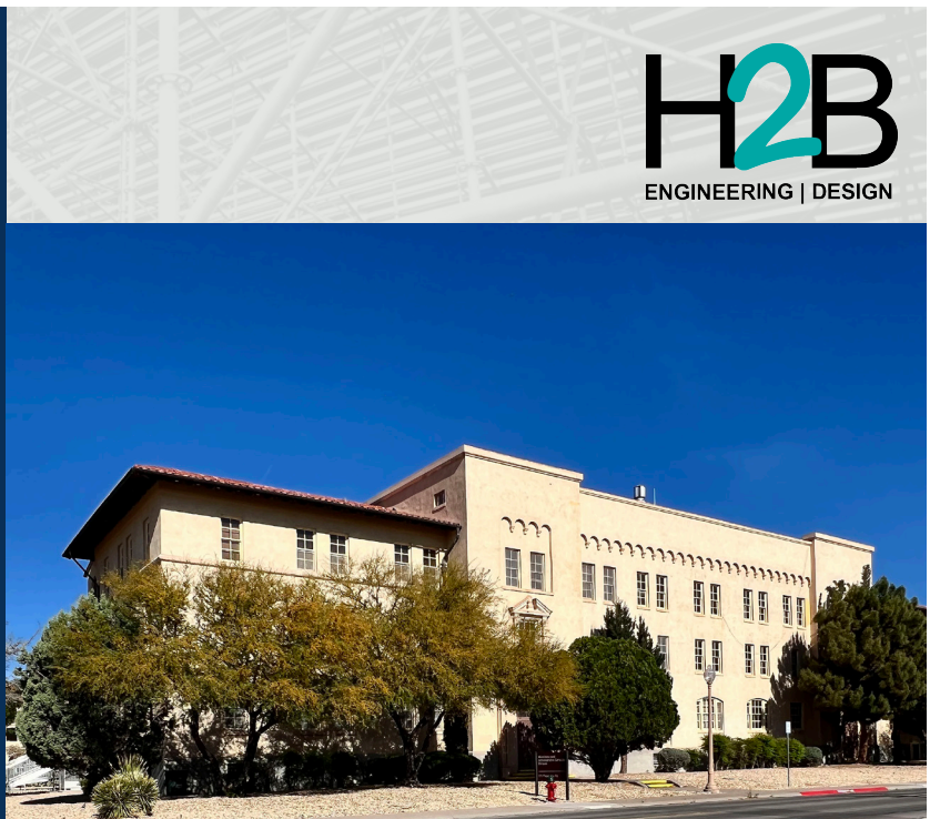
Fort Bliss Intelligence Coordination Annex Building 516 USACE Fort Worth District, Fort Worth, TX