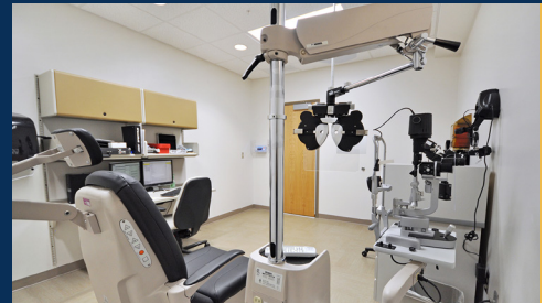
Lawton Community Based Outpatient Clinic Oklahoma VAHCS, Fort Sill, OK