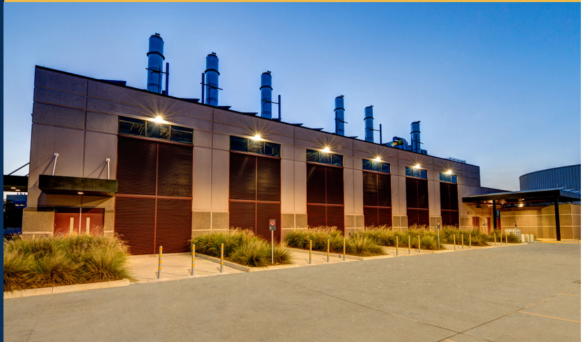
Combined Heat & Power Plant Michael E. DeBakey VA Medical Center, Houston, TX