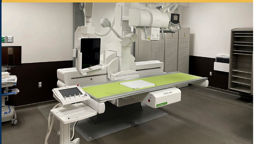
Radiology Department Expansion/Renovation Northern Arizona VA Health Care System, Prescott, AZ