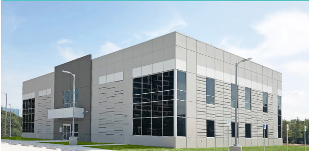
New Administration Building Michael E. DeBakey VA Medical Center, Houston, TX